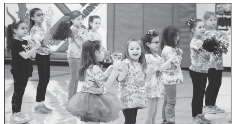
Garretson Elementary students enjoyed Cheerleading Camp last week, ending with a performance at the Girls' Varsity Basketball game on Thursday.